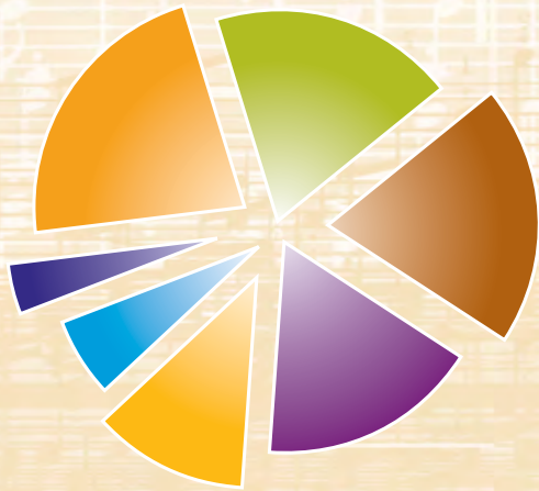
2005 International Earnings

In 2005, SOCAN distributed $42-million in royalties received from foreign performing rights organizations (PROs), representing 23 percent of the total royalties distributed, which is clear evidence that Canadian music creators are enjoying record success on the world stage. More than 95 percent of SOCAN members' international earnings are derived from 15 specific performing PROs, and more than 75 percent of the total from the top six: ASCAP and BMI in the U.S., SACEM in France, PRS in the U.K., GEMA in Germany and SIAE in Italy.